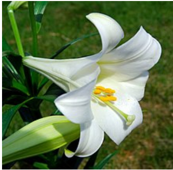
THE EASTER LILY

On Easter Sunday morning, Churches will be filled with floral arrangements of these beautiful white flowers Lilium Longiflorum , also known as White Heaven, the Trumpet Lily, or the Easter Lily. For many, the beautiful white flowers of the Easter Lily symbolize purity, virtue, innocence, hope and life – the spiritual essence of Easter.